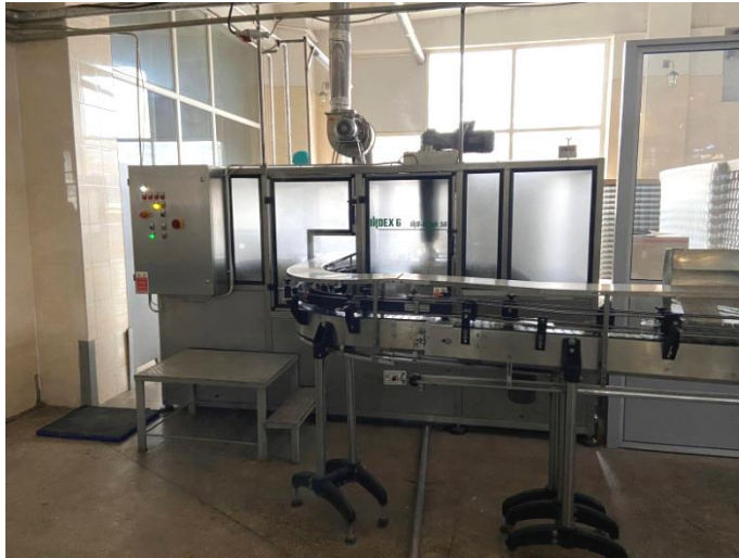
PHOTO OF MANUFACTURING FACILITIES